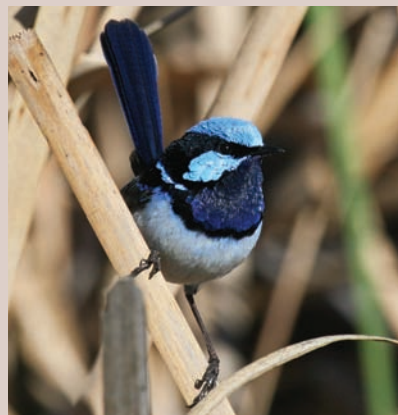
Front cover image: Superb Fairy-wren