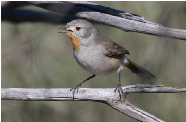
Top: Beautiful Firetail, Bear Gully. Above: Redthroat male, Bowra Station.