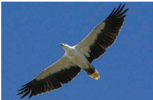
Sea Eagle.

An addition to its own network of branches, BOCA has an extensive group of affiliated organisations. These are independent local groups which have a common purpose with BOCA. We are currently examining the nature of this relationship to ensure that it is of real benefit to each partner.