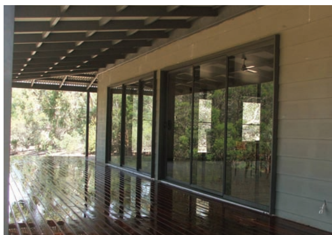
The Clare Miller Interpretation Centre.