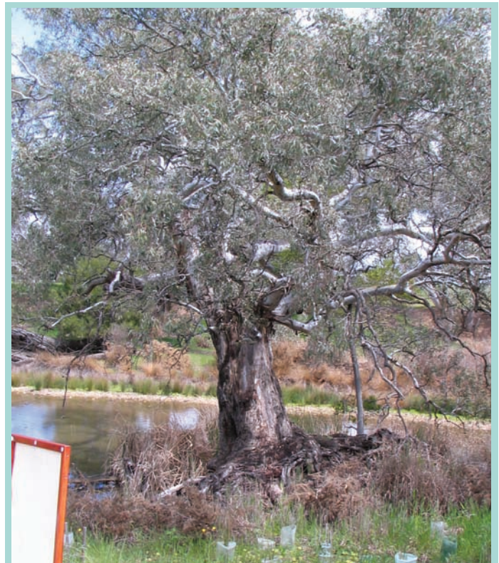
River Red Gum by the Loddon River (Vic).

The most vocal bird for the day was the Singing Honeyeater but even it faced competition from the local school children. In closing the event the children sang several songs describing the importance of the river in the local environment. My favourite was a song about frogs that started with the children imitating frog calls. It sounded just like a wetland with the different species being quite distinct.