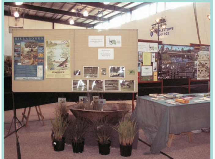
Templestowe College (Vic) display.