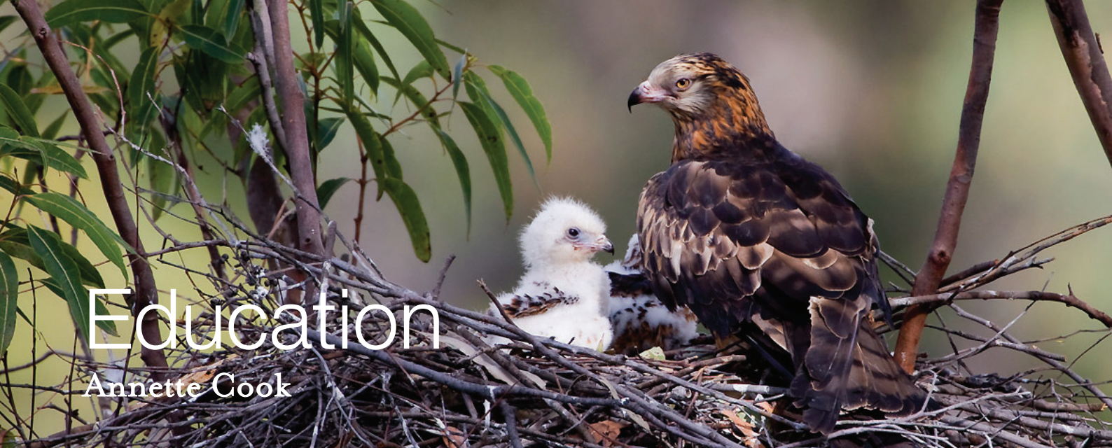
Square-tailed Kite.

BOCA Education initiatives continue to grow and develop across the country. Bird Week 2008 has helped to provide the impetus for many branches to take up the challenge. Displays and activities have been held during October, especially during the last week which was Bird Week 2008. The aim of Bird Week is to raise public awareness of native birds and to create interest in BOCA. Bird Week helps birders and non-birders alike to learn which birds are doing well, which need help, and what we can do to make a difference. The theme for this year was Revealing Raptors . Education resources were made available on the BOCA website and will remain after Bird Week, as did the Parrots on Parade information from 2007. Discussions for 2009 have already begun - further information will be available early next year.