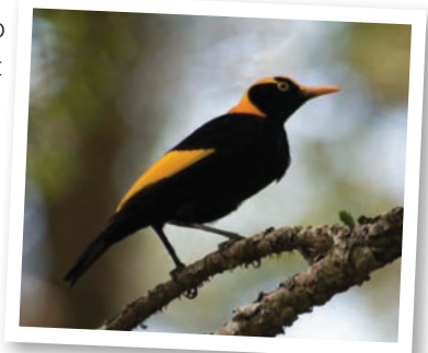
Regent Bowerbird.

Bundyloc from Bundaberg in Queensland held a camp at Bulburin National Park, Granite Creek. The fine warm weather proved to be great for bird watching. Ninety-two species were seen in sub-tropical and rainforest habitats. The group started birding at first light and saw lots of rainforest favourites including the Regent Bowerbird pictured right. During the night a Marbled Frogmouth called but could not be seen.